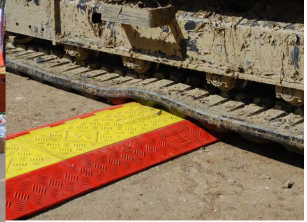
PICTURED: CP5X125 IN-USE (LEFT) CP5X125 IN USE (TOP)

Checkers™ Cable Management offers the most extensive line of high performance cable/hose protection products in the world. These durable cable protection systems provide a safer method of passage for pedestrian traffic, vehicles and heavy duty equipment while protecting valuable electrical cables, cords and hose lines from damage.