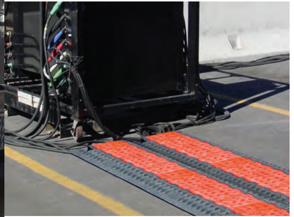
PICTURED: GD5X125 IN USE (TOP) GD3X225 IN USE (LEFT)

Checkers™ Cable Management offers the most extensive line of high performance cable/hose protection products in the world. These durable cable protection systems provide a safer method of passage for pedestrian traffic, vehicles and heavy duty equipment while protecting valuable electrical cables, cords and hose lines from damage.