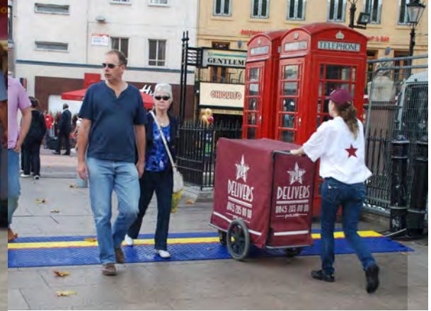
PICTURED: GD5X125-ADA IN USE (LEFT) HEAVY DUTY ACCESSIBILITY RAMPS IN USE (TOP)

Checkers™ Cable Management offers the most extensive line of high performance cable/hose protection products in the world. These durable cable protection systems provide a safer method of passage for pedestrian traffic, vehicles and heavy duty equipment while protecting valuable electrical cables, cords and hose lines from damage.