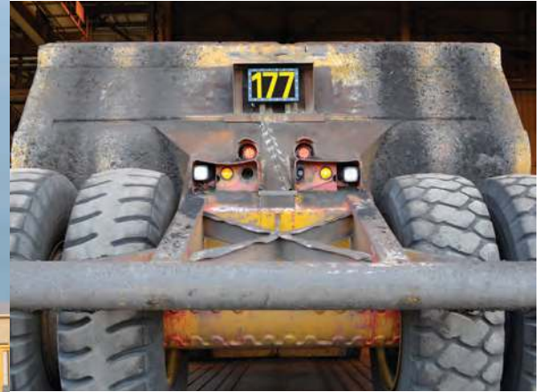
PICTURED: LUN SIGN IN USE

CHECKERS™ Vehicle Identification Signs provide fast and easy identification of any type of equipment in mining, construction, industrial, utility, or traffic work environments. Available in both small and large sizes, these identification signs are great for either small utility vehicles or haul trucks and larger equipment. Durable and highly visible, these signs will stand up to the abuse of a job site while providing optimal light output.