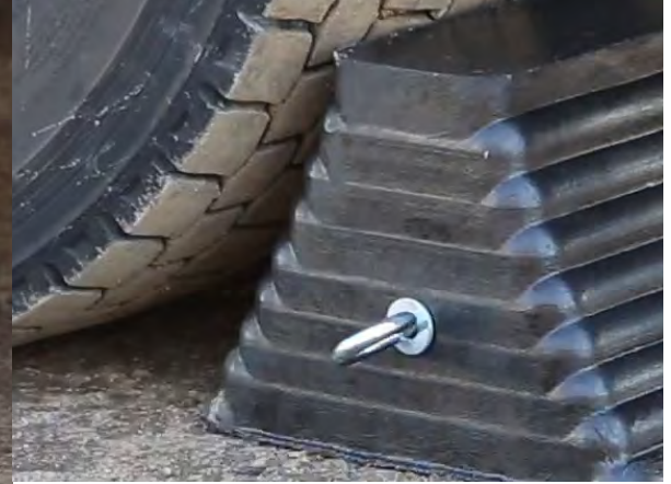
PICTURED: RC915 IN-USE

Checkers™ Wheel Chocks comply with the safety requirements of a variety of industries and ensure a safe working environment while your vehicles are at rest. Offered in a variety of styles, our wheel chocks provide a safe chocking solution for any type of vehicle.