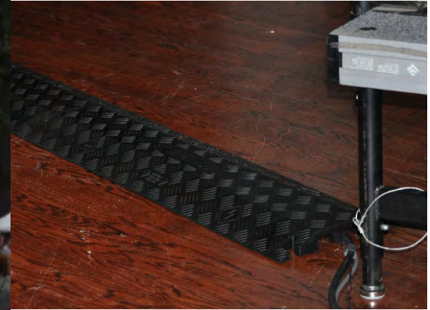
PICTURED: FL2X1.75 IN USE

Checkers™ Cable Management offers the most extensive line of high performance cable/hose protection products in the world. These durable cable protection systems provide a safer method of passage for pedestrian traffic, vehicles and heavy duty equipment while protecting valuable electrical cables, cords and hose lines from damage.