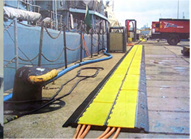
PICTURED: YJ5-125 IN USE)

Checkers™ Cable Management offers the most extensive line of high performance cable/hose protection products in the world. These durable cable protection systems provide a safer method of passage for pedestrian traffic, vehicles and heavy duty equipment while protecting valuable electrical cables, cords and hose lines from damage.