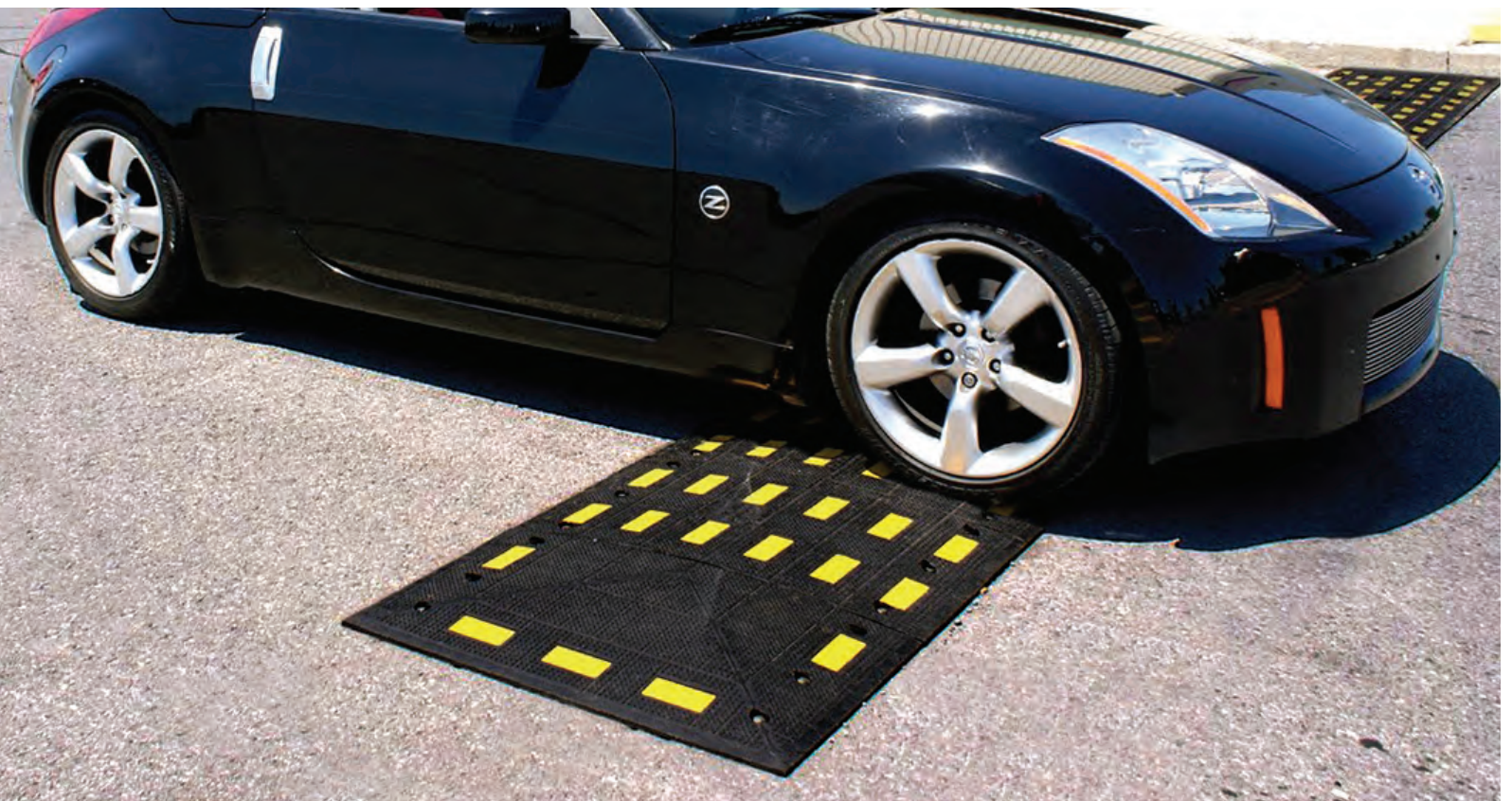
PICTURED: SAFETY RIDER SPEED HUMPS

Checkers™ is a full-service manufacturer of parking lot safety solutions. We design and manufacture traffic control products that help cars navigate and park safely. Our main goal has been to create solutions that protect motorists and pedestrians from the perils of today's parking lots. As such, Checkers™ products have been designed and developed with speed reduction, driver and pedestrian safety in mind. All our solutions are manufactured from 100% recycled rubber and plastic. Our speed bumps or parking blocks, for example, are longer lasting, highly visible, and more car-friendly than asphalt or concrete alternatives. Not only are Checkers™ traffic safety solutions environmentally friendly, they can also be installed for either temporary or permanent use.